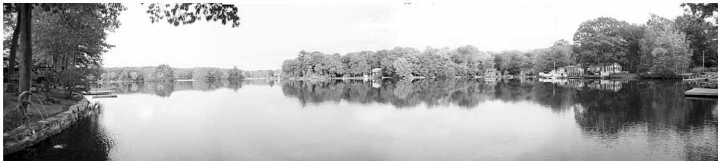
Panoramic view (approximately 170 degree view) of Lake Chaffee's southwest cove. Taken from dock at 147 Lakeview in September 2008