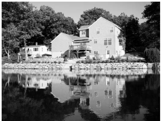
Recently landscaped lakeside at 20 Armitage Court

Tim and Amy Donahue...(continued on page 3)