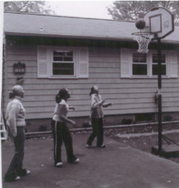
Future UCONN Women's Basketball Stars Practice Hoops at Lake Chaffee.

Lake Chaffee News We want a catchy, fun and interesting name that everyone will remember and everyone will want to read. Please submit any name ideas to the Editor's box on the entry porch on 10 Perch Drive.