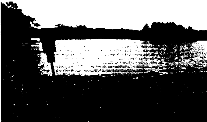
Volunteers needed to repair the dock after Budget Meeting on Sunday