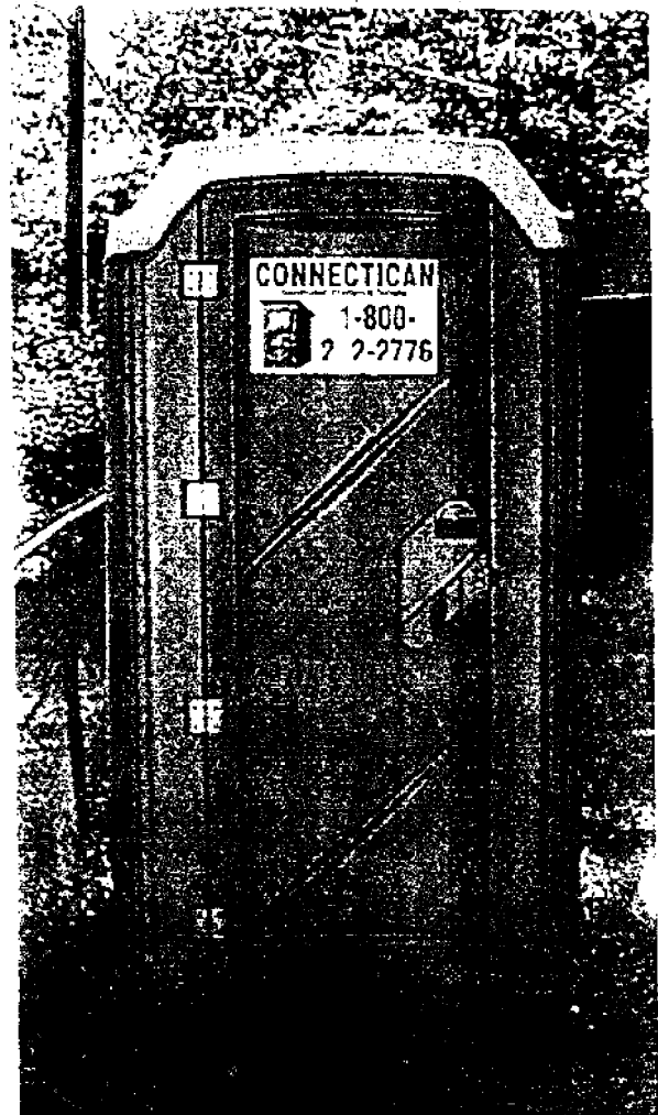
So Long Old Friend... due to budget constraints LCIA budget had to cut the can contract for the rest of this yr. and next year.